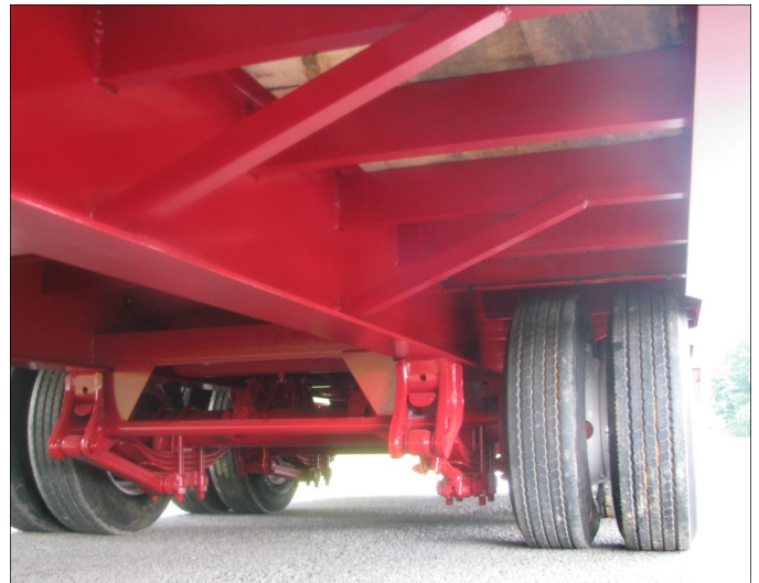
Shown is our 20 Ton Equipment Trailer.

* Calculations were made on a standard length 20 ton.