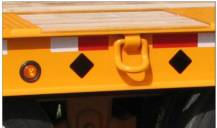
A992 8 x 4 " I-Beam Grade 50 Sidrails with Diamond & D-Ring

This Combination of design, strength, and ease of use will defiantly make most lowboys jealous.